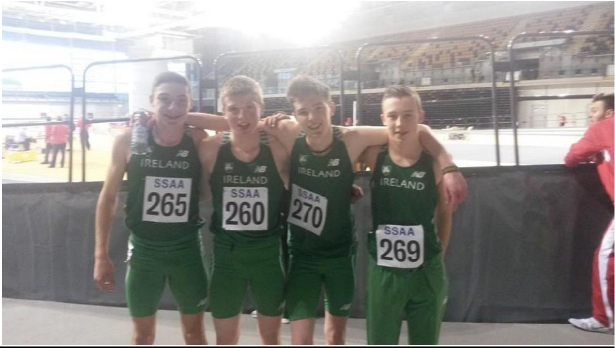
Irish Junior Boys Team