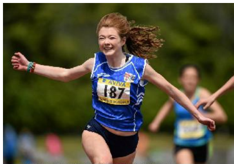
Some Munster Schools Medal Winners