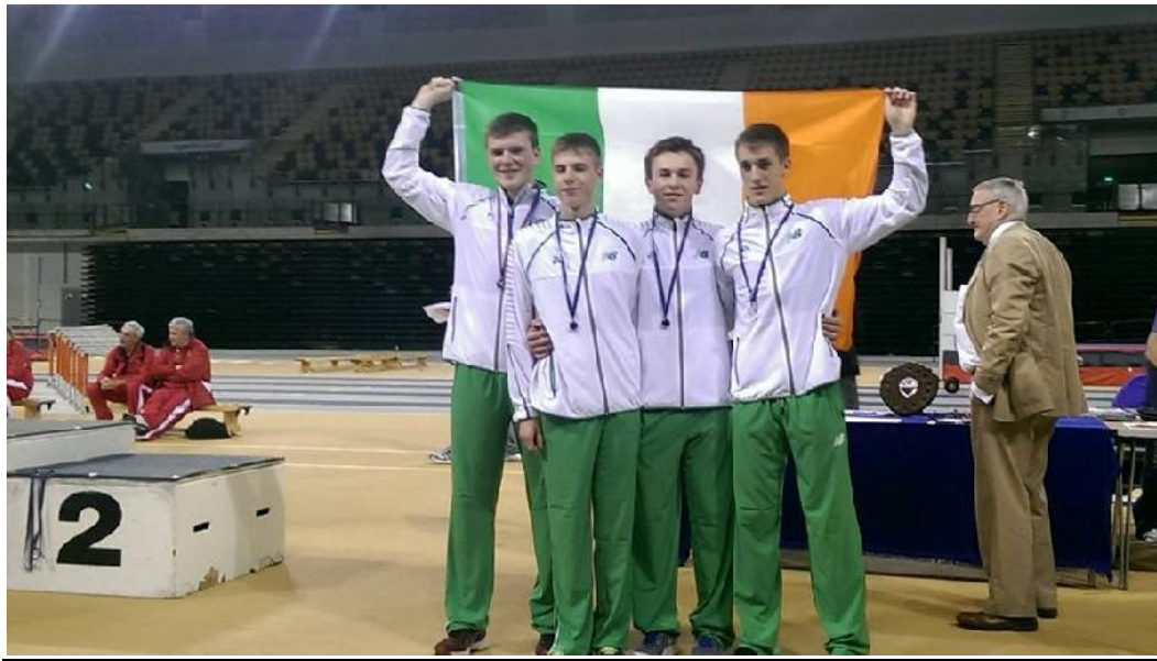
Team Silver for Irish Intermediate Boys