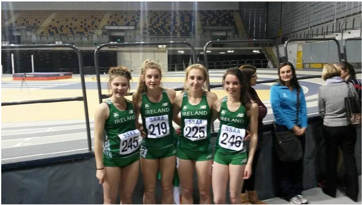
Irish Junior Girls Team