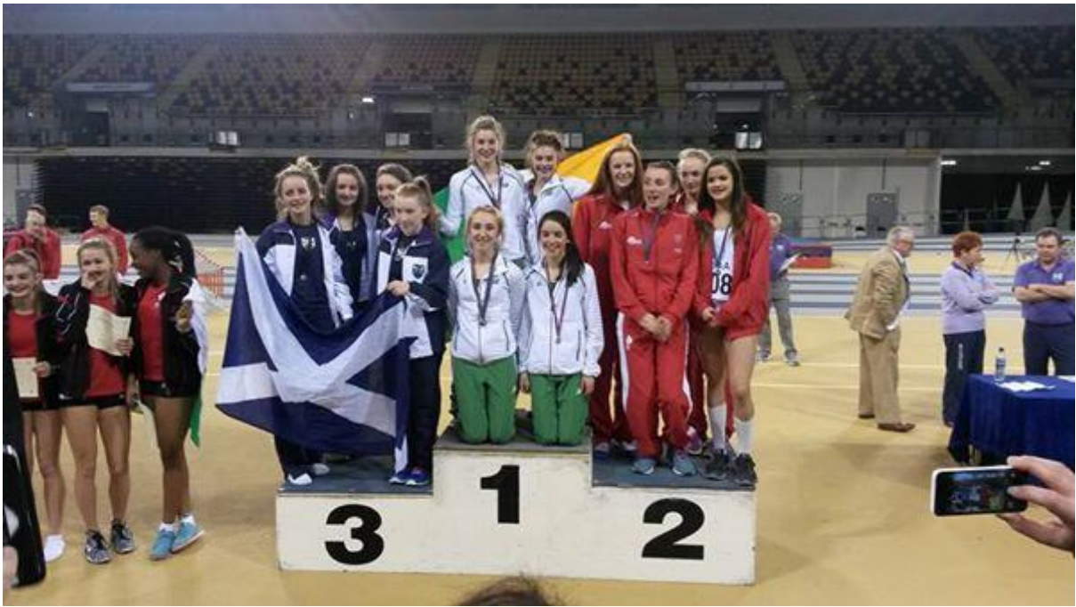
Gold for Irish Junior Girls Team