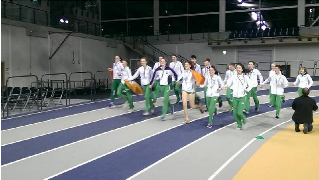
Joy for all, the best Irish Performance ever!