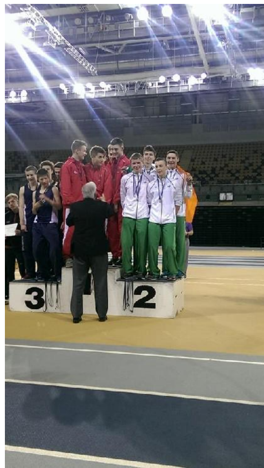
Irish Junior Boys Team who won silver